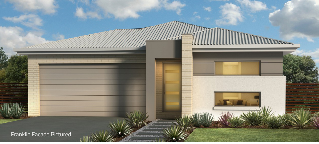
Franklin Facade Pictured