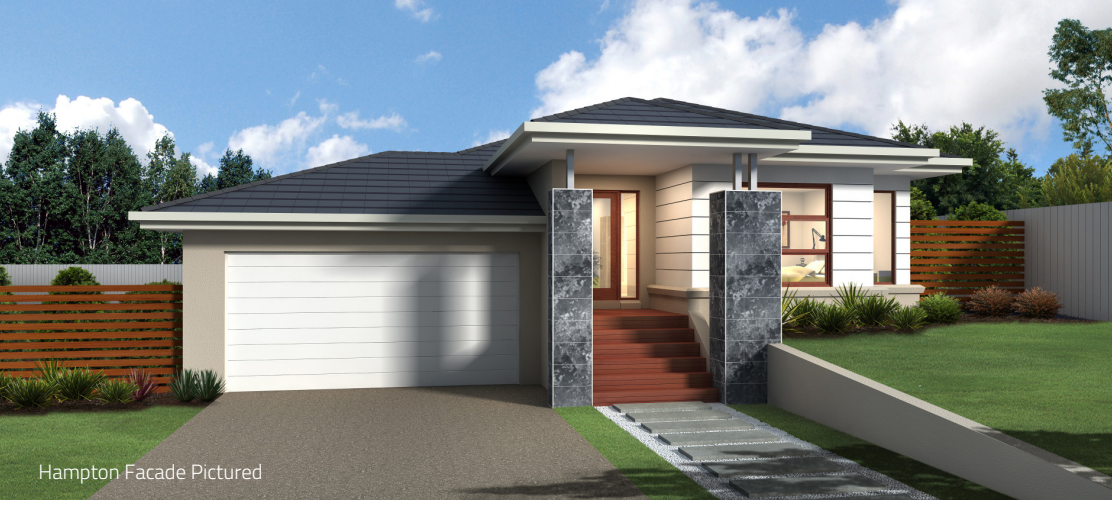
Hampton Facade Pictured