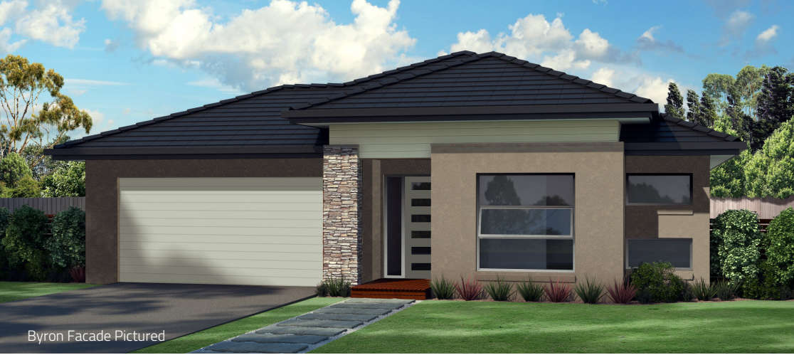
Byron Facade Pictured